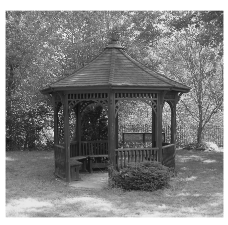
The Gazebo at Bicentennial Park

The full walk will take approximately 1 1/2 hours.